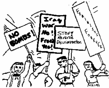
Debaters take positions on many issues.