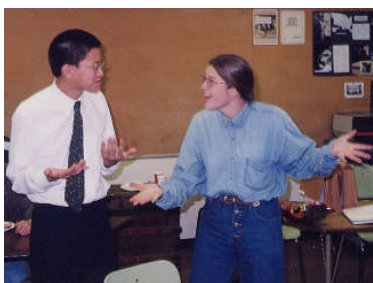
These two debaters get quite heated about an issue they are debating.

This question is one that President Theodore Roosevelt asked when he called academic debate a moral perversion because people sometimes take positions with which they disagree. Debaters will agree that it is a bit strange to finish one debate and then go right into another and argue virtually the complete opposite position. But academic debate's purpose is not to encourage you to repeat what you already think about an issue. Debate makes you argue both sides of an issue and in doing so, helps you learn why each side believes what it does. Arguing both sides will help you make an even stronger case for your position because now you will know the other side's arguments and how to defeat them. Plus, you might actually change your mind. This "moral perversion" will make you more open minded and a better advocate.