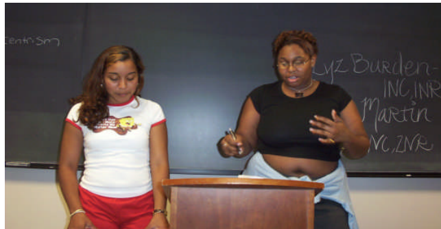
Two debaters speaking their mind about an important issue.

If you have a similar interest in becoming a better advocate, debate is the activity for you. In this chapter, I will introduce you to academic debate. I will discuss what debate is, why debating is a good idea, the issues that you debate, the affirmative and negative side of the issues, and what happens in a debate.